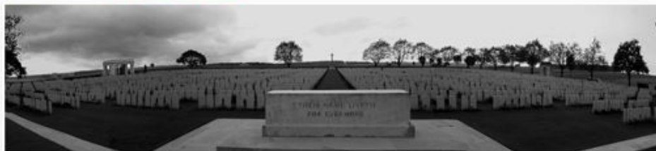
An international school programme to commemorate the First World War France - New Zealand - Australia

SHARED HISTORIES Mémoires héritées, histoire partagée