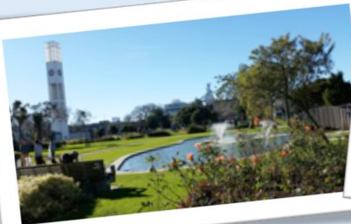
Palmerston North, NZ.

As the President of the MLTA ACT Inc, I attended the AFMLTA Assembly in Palmerston North, New Zealand on 5 and 6 July. We spent the two days working through a busy agenda. AFMLTA Executive presented their reports to the Assembly and all State and Territory delegates also presented their reports. There was the election of AFMLTA Office bearers. We then received an update from the MLTAV regarding their progress with the planning of the AFMLTA 2015 Conference in Melbourne. A summary of the projects and activities being conducted by the AFMLTA was shared followed by a review of the 2013 Strategic Plan. The meeting finished with the strategic planning for 2014 and the welcoming of the new President of AFMLTA, Kylie Farmer. I look forward to sharing with you some of the fantastic work that the AFMLTA have been doing over the last year as well as for this year. I strongly encourage you to go to the AFMLTA website http://afmlta.asn.au/ and familiarise yourself with what your Association is doing, especially in light of the Australian Curriculum: Languages and the many projects and activities they are involved in.