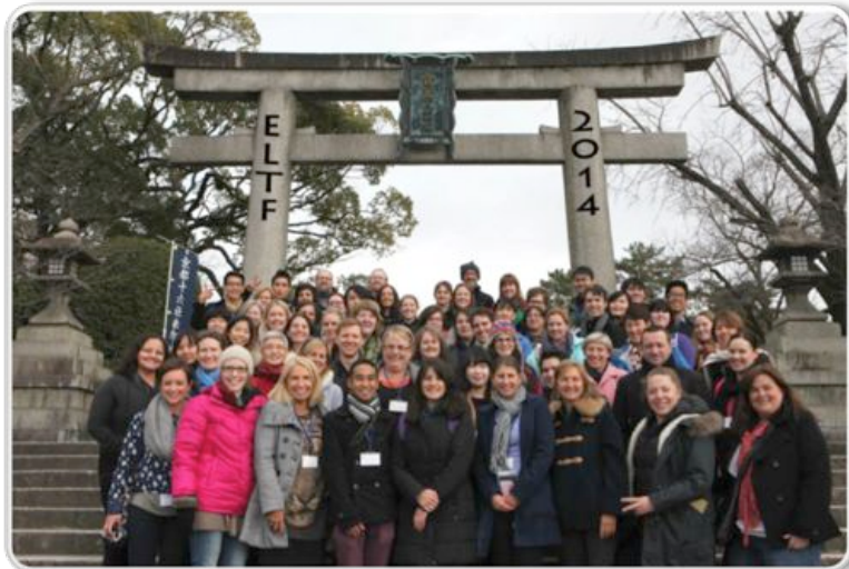
Whole group photo at Toyokuni Shrine, Kyoto

From January 1 st to the 23 rd , 56 delegates and 3 coordinators from around Australia participated in the 2014 ELTF program to Japan, where pre-service, practicing and retraining teachers had the opportunity to improve their Japanese proficiency and broaden their cultural perspectives over the 4 week program. It was also a great opportunity to strengthen networks within the national Japanese teaching community, especially for pre-service teachers. The program consisted of intensive language tuition at Kansai University, day trips and short excursions to Kobe and Kyoto, and plenty of free time for participants to explore the Osaka area and places of interest.