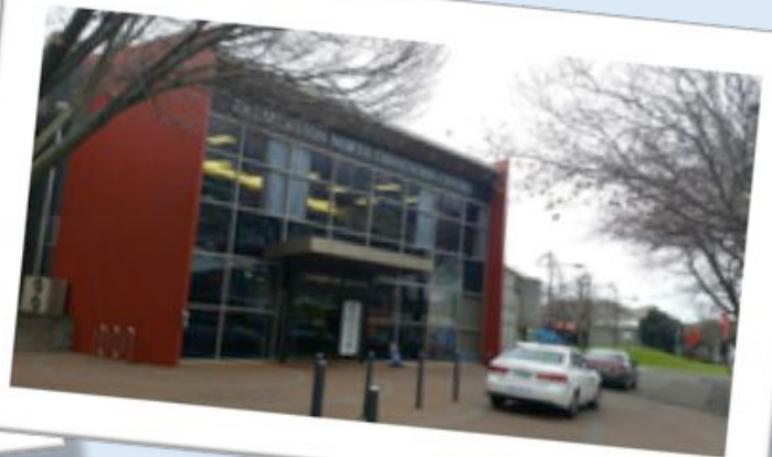
Palmerston North Conference Centre