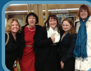
The MLTA ACT Executive 2013 at the Cocktail Reception at the National Portrait Gallery