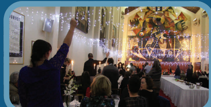
Games at the Gala Dinner with Gold Sponsors, Language Perfect