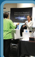
Our Gold Sponsors, Language Perfect