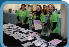
Registrations on Day 1!