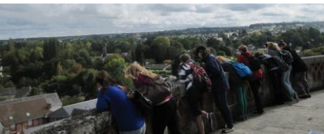
Enjoying the view from Amboise

We are uniquely linked to this special type of excursion in our desire to give our students that much sought after authentic language experience. This year, At Amaroo School we organised our second ever overseas excursion for the French program, this time to France- Paris, Tours and Amiens.