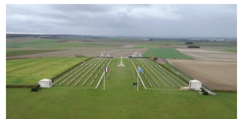
The Australian National Memorial at Villers Bretonneux- very moving