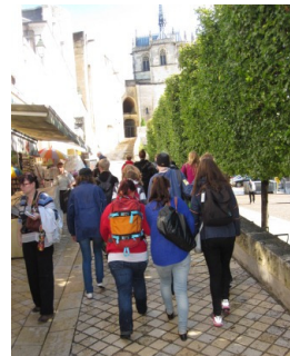
Walking up to Amboise Castle in Tours

As we moved on from Tours to Amiens, our mood changed from playful and adventurous to more somber and reverent. We listened with awe as our guide told us the stories of our Australian soldiers' involvement in the Somme area in World War I. We were touched