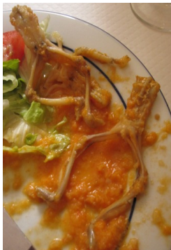
Many students enjoyed trying frogs' legs out of curiosity in Paris

Ending our Paris stint in this stylish way made us wonder what could compete in the rest of the hexagon of France.