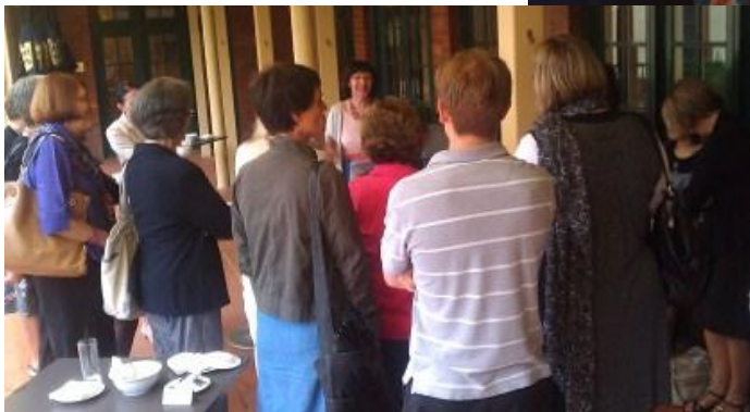
Kurrajong Hotel Barton