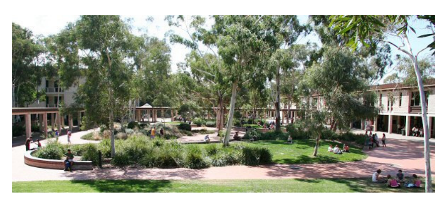
The University of Canberra Campus