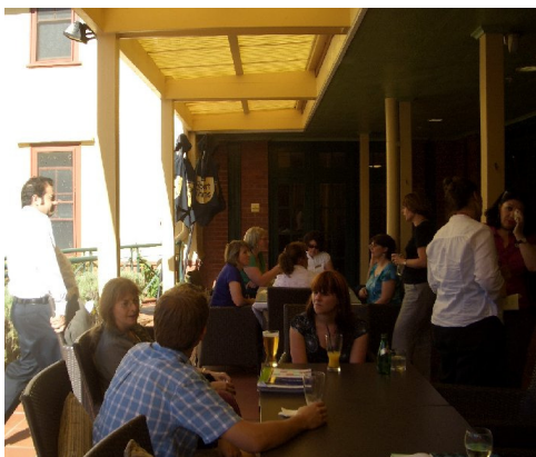
Networking at the ACT MLTA Meet and Greet

The 2010 MLTA Meet and Greet was held at the beautiful Kurrajong Hotel in Barton on a warm, sunny afternoon. Language teachers from all over the ACT gathered to enjoy a cool beverage and participate in some relaxed professional networking. This was particularly important for the new language teachers in our state. Lucky door prizes were awarded to several members who will be now be enjoying their free movie tickets.