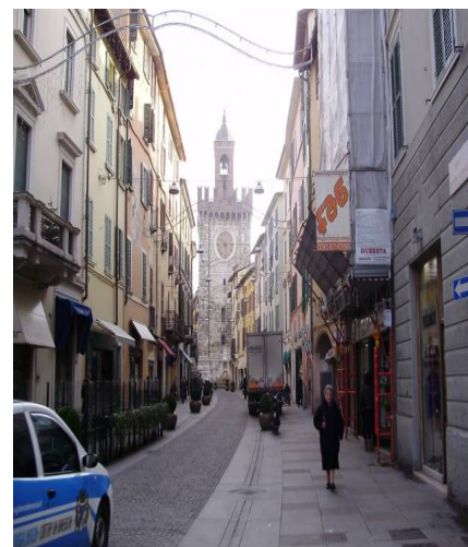
A typical street in Brescia